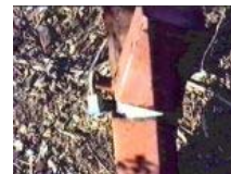
A lot can go wrong with test wells. This one isn't locked. What is it testing?

THIS SAFETY SUGGESTION ALSO WORKS WITH LIONS, BATTERY ACID, ALLIGATORS, AND NUCLEAR TEST SITES!